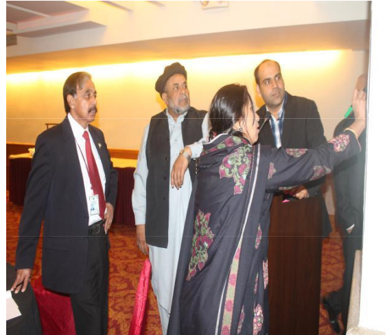
Participants on Expectations Exercise