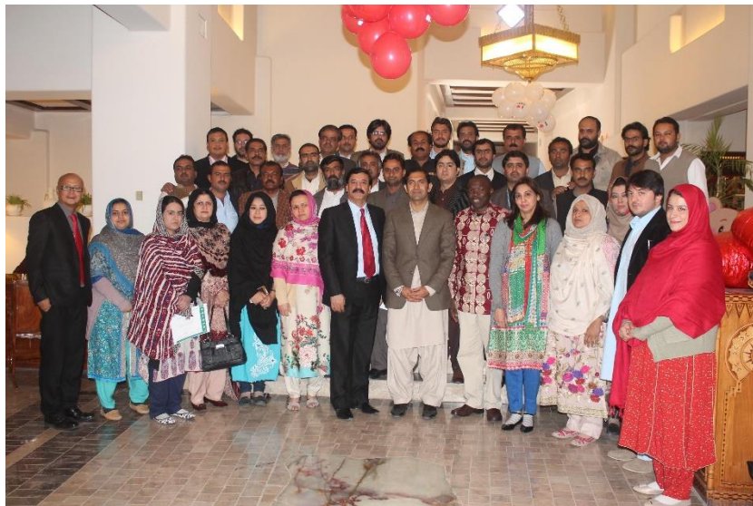
Course Participants at Quetta