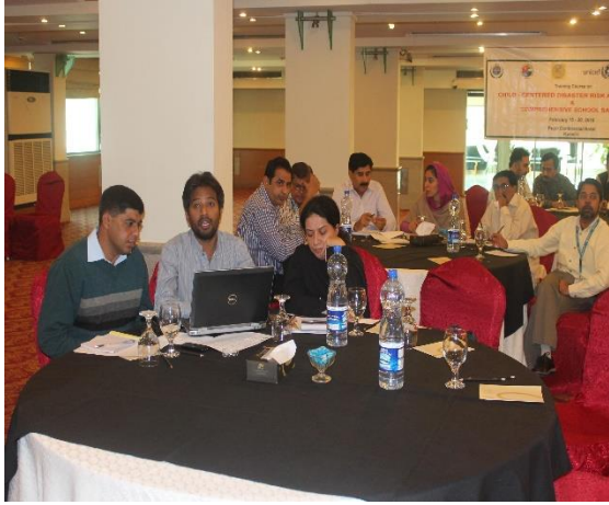
Participants performing vulnerability Assessment