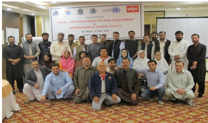
Course Participants at Peshawar